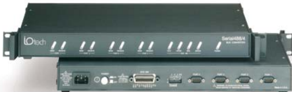
Computers with an IEEE interface can command up to four serial instruments and peripherals with one Serial488/4

The Serial488/4 is packaged in a rugged rack mountable case with an internal power supply. Serial port connections are made via four 9-pin sub-D style connectors.